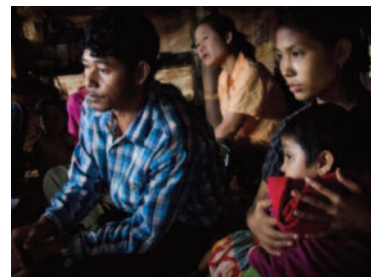
ZARIN SERIES, 2008 Shirin Neshat